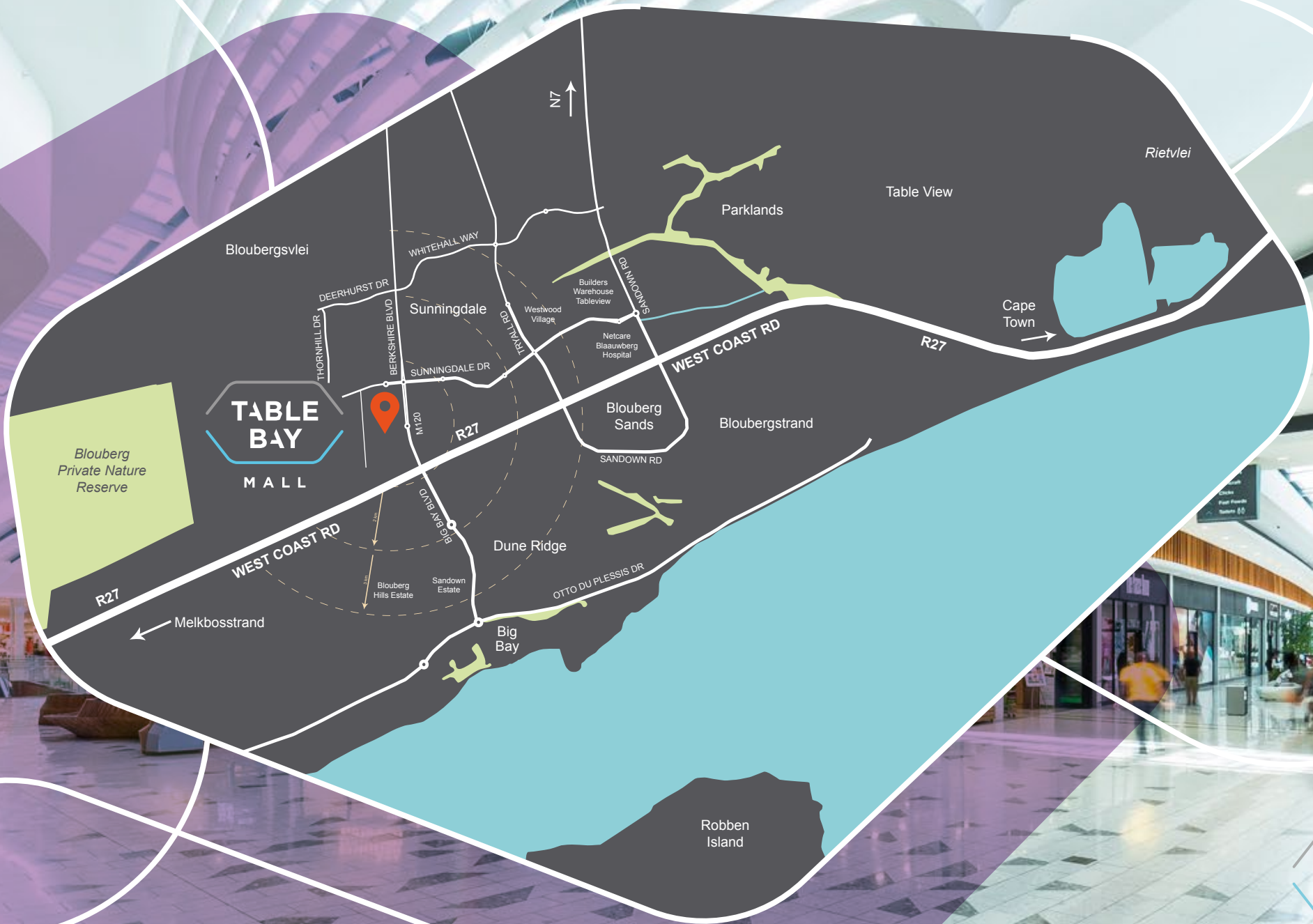
TABLE BAY MALL